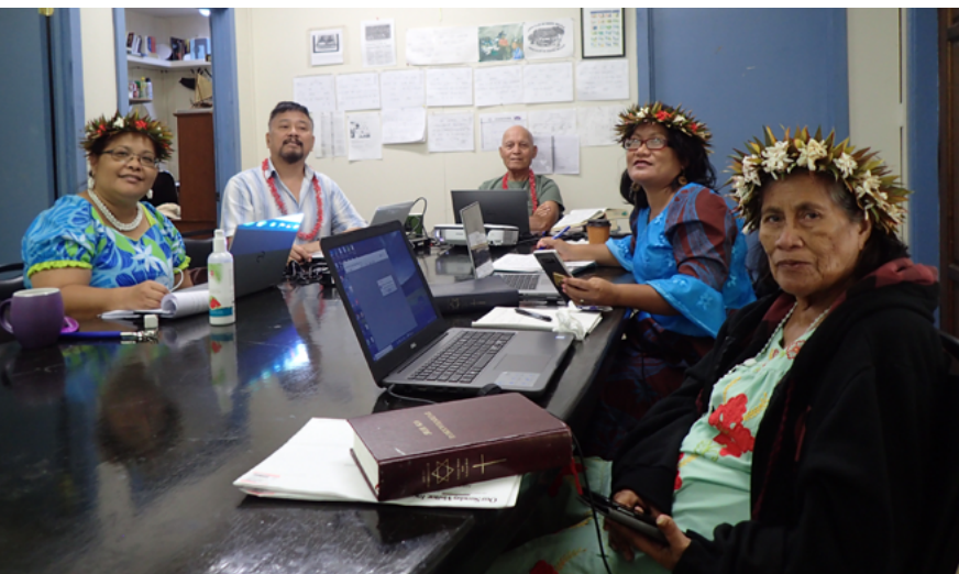
A Bible Society in the South Pacific translation team